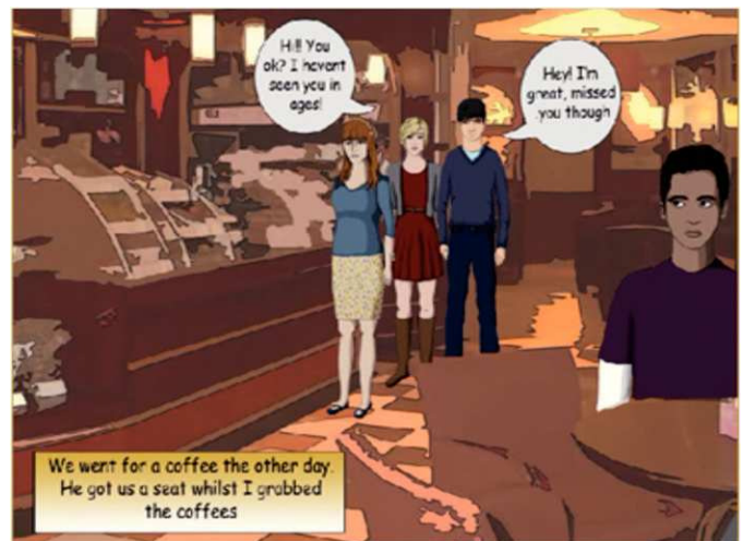
Figure 1. Image taken from a scenario described in table 2.

As reviewed, previous research has identified the quantitative improvement associated with engaging in serious games regarding coercion in relationships (Arnab et al, 2013) and yet little is known about how young people view the experience of engaging with serious games when learning about sensitive topics. Consequently, the aim of the present study was to explore young people's views on