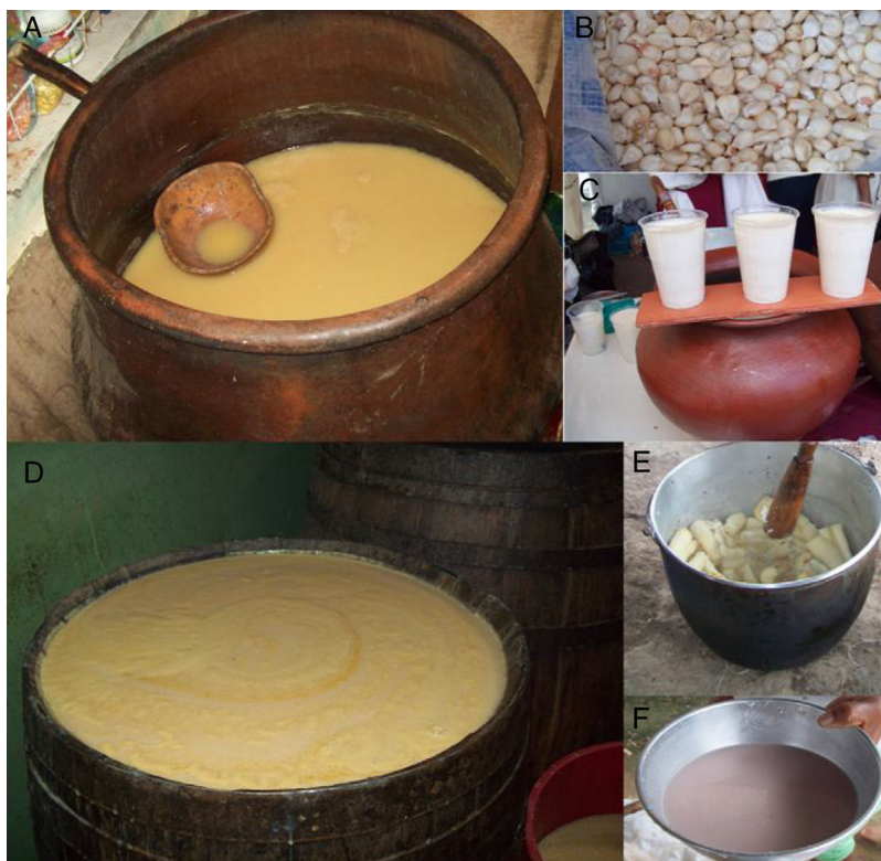
Fig. 1 – Chicha de jora (A); Morochos (white maize) (B); Chicha de morochos ready to drink (C); seven-grain chicha (D); cassava for chicha de yuca production (E); Chicha de yuca ready to drink after addition of seeds of the Ungurahua palm (F).

was expressed as the means of each morphotype in each sample in colony-forming units (cfu/mL). Representative colonies of each different yeast morphotype from both culture media were purified on YMA plates and preserved at -80^{\circ}\text{C} or in liquid nitrogen for subsequent identification.